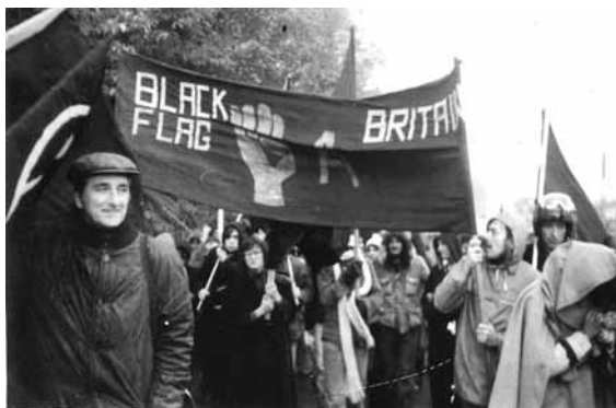
The March on Bayonne, 1975