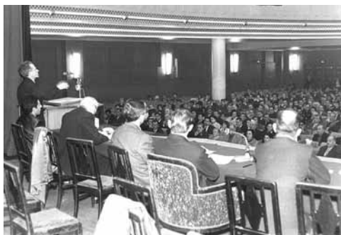
Meeting following the re-unification of the CNT in 1961

OA: There is “scope” to the extent that Cubans are losing their fear of being outspoken and the regime (as in the dying days of the Francoist dictatorship) can no longer be as open in its repression as it once was. This is what we are finding with the ‘Ladies in White’ and other opposition groups .. I am quite optimistic about the prospects for libertarianism in Cuba for the comrades with whom we are in touch (members of the Observatorio Crítico) strike me as very capable and appreciative of the chance for anarchists to expose Castroism’s sham socialism and demonstrate the revolutionary potential of libertarian socialism.